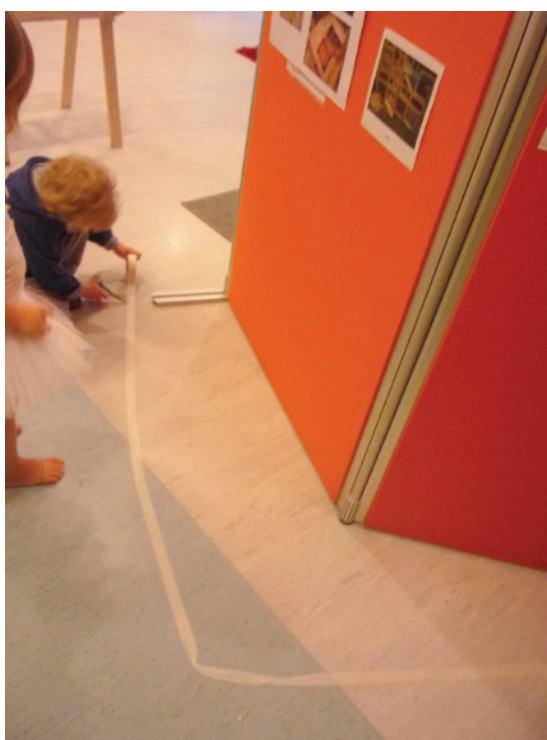
Child constructing a 'yellow line' in front of children's photo exhibition at the kindergarten.

Child D then exclaimed "Well how could she know, Becs [the teacher], there is no yellow line!" Child D then asked for some tape to construct a line around the exhibition to provide a barrier. Later he stood in front of a group of children and explained what the line meant. He emphasised that people needed to stand behind the line to keep the work safe. After that lesson, there were no more incidents of children touching the photographs.