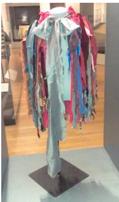
Let's celebrate exhibited at Te Papa

We chose this fabric because it is so soft and we are good at tying knots. It looks a little like the muka (flax fibre) that the weavers showed us how to make in "Kahu Ora". They let us take harakeke (flax) back to the kindergarten.