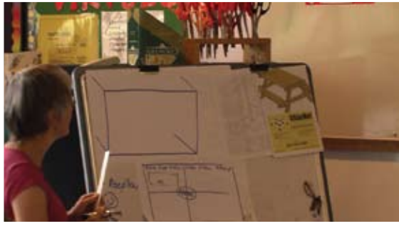
Figure 5. Glenis begins to draw a rectangular box