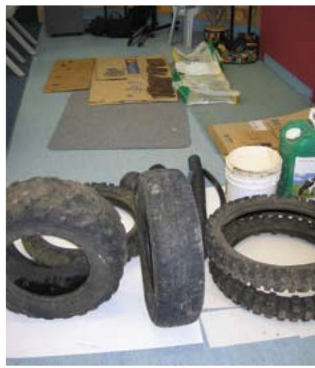
Figure 2. Farm materials on classroom display

> In the second example, Jenny's Years 4–5 students were designing and making their own percussion instruments for a school production. These instruments were to be made from recycled farm materials. The students visited a dairy farm as part of their social studies programme and, while they were there, they were able to gather any discarded materials. Jenny had indicated to the students before the visit that they would be searching for materials to make their percussion instruments. This meant that the students were aware of the purpose for the materials, and so they gathered the materials with percussion instruments in mind.