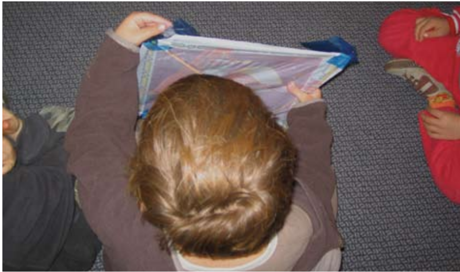
Figure 1. Simon examining reinforced corners

They also went outside and flew these real kites to judge their effectiveness. They talked about the relative merits of each kite and discussed their reasons for any differences in performance.