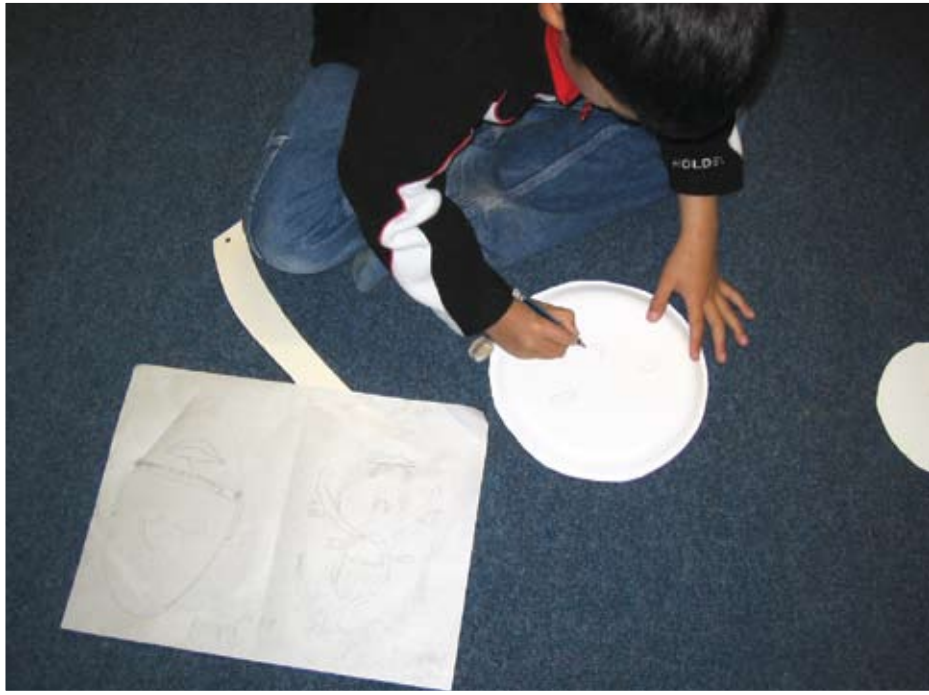
Figure 4. Maeroa making a mask using his plan